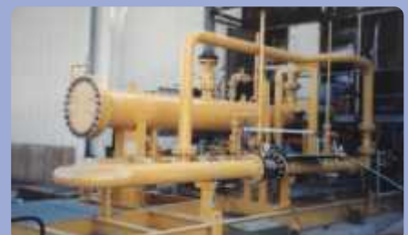
Duel Fuel Conversion Baghabari 71 MW Power Plant of BPDB