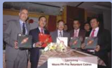
Launching of Macro Fire Retardant Cables