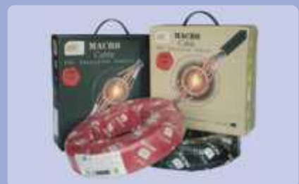
Macro Fire Retardant Cables