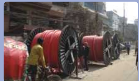
33 Kv Under Ground Cable Network of DESCO