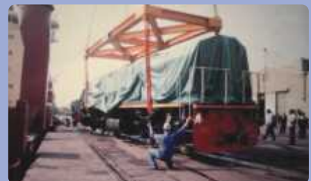
Supply of 19 Locomotives to Bangladesh Railway