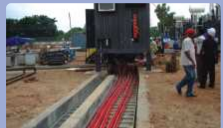
Laying & Termination of Cables Aggreko's Power Plants