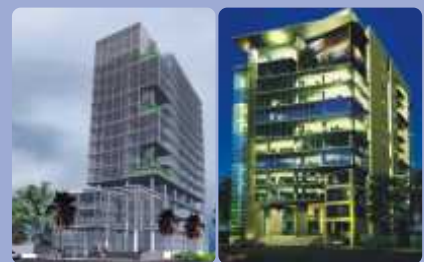
Ridge Park, Gulshan