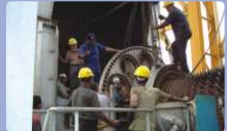
Rehabilitation & Maintenance BPDB's GT Power Plants

MPL has executed underground cable system up to voltage level of 230 kV. Recently MPL has successfully implemented 11 kV and 132 kV Underground Cable Laying, Jointing, Termination, Testing and Connection work of Ghorashal, Brahmanbaria and Ashugonj Power Plants of Aggreko (U.K.) Limited for their Rental Power Generation Projects of BPDB.