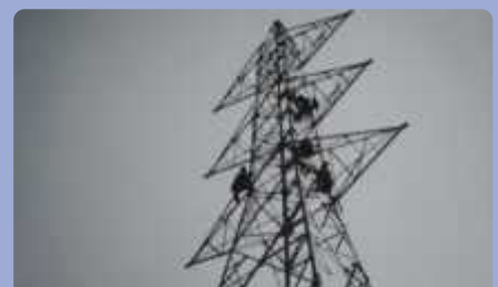
132kV and 230kV Transmission Line Projects of PGCB