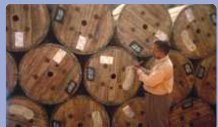
Supply of Distribution Cables To REB