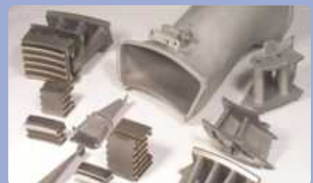
Refurbishment of Hot Gas Path components BPDB's Gas Turbine Power Plants