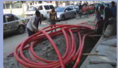
Turnkey Contract of Underground Cable Network DESA-Greater Dhaka Power Distribution Project