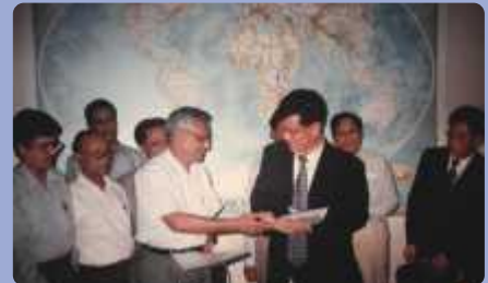
Contract Signing Ceremony for Supply of Locomotives Bangladesh Railway under EDCF Loan

The role of MIL is not limited only to support their clients with quality products & services, but also as a facilitator in customizing a total project including project financing from bilateral sources. 'Greater Khulna Power Distribution Project' of BPDB was the first project implemented under EDCF loan of Government of Korea, executed by Macro in association with Samsung and Hyosung of Korea. In continuation thereof, Macro has strengthened its activity in the communication sector by supplying 19 numbers M.G Locomotives to Bangladesh Railway under EDCF loan.